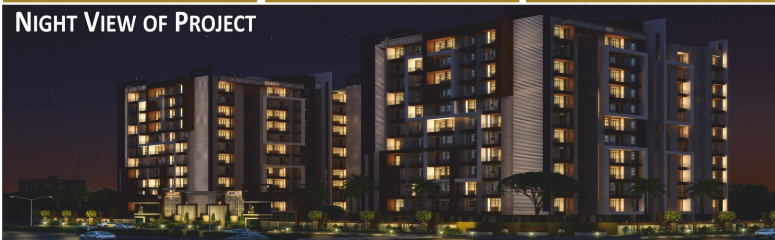
NIGHT VIEW OF PROJECT