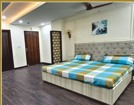
CLUB'S GUEST ROOMS