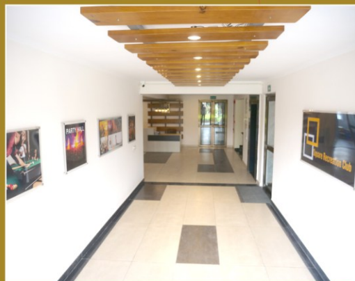
CLUB HOUSE ENTRANCE