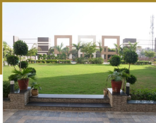
LUSH GREEN GARDEN