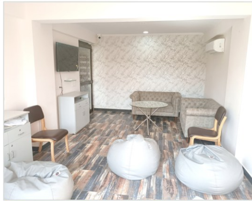
X BOX GAMING ZONE

With landscapes, lavish amenities, and luxurious apartments in towers that kiss the skies, square arcade offers the perfect blend of connectivity to all parts of the city, with great views of the city's skyline, abundant green spaces, and a lot of charm.