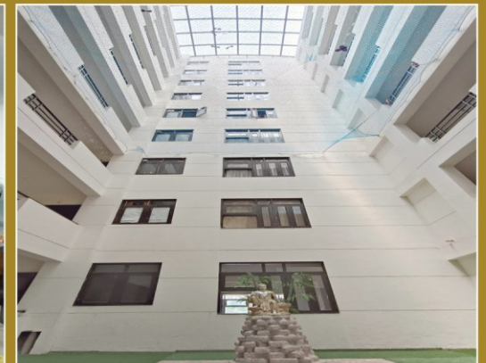
OPEN SHAFT FOR VENTILATION