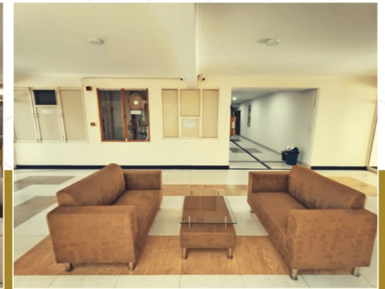
SPACIOUS LOUNGE ON EACH FLOOR